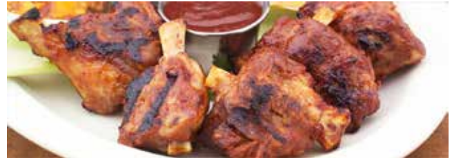
Pictured: Hog Wings will be served at this year's BBB celebration. It's an easy-to-hold pork entree on its own stick! (Please refrain from drooling on the newsletter.)

This event is graciously sponsored by Community State Bank, Doll Distributing, Dermus Skincare, Spencer Office Supply, Cotton Graves Farm Management, Winther, Stave and Company, ReMax of Spencer, Edward Jones, Denison Drywall, Iowa Pork Producers and Graham Tire. Thank you to our wonderful sponsors!